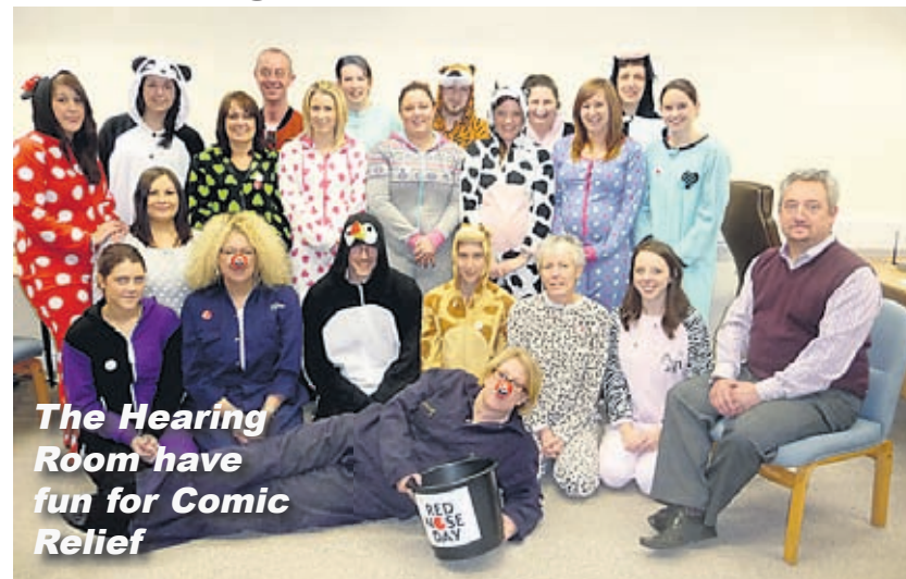
The Hearing Room have fun for Comic Relief