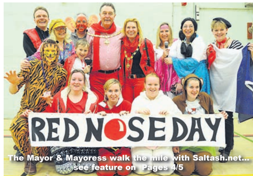
The Mayor & Mayoress walk the mile with Saltash.net... see feature on Pages 4/5