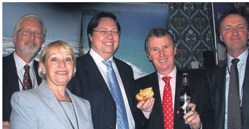
Also pictured: The Deputy Speaker, Nigel Evans, was one of the many MPs who tried Tribute and a Pasty