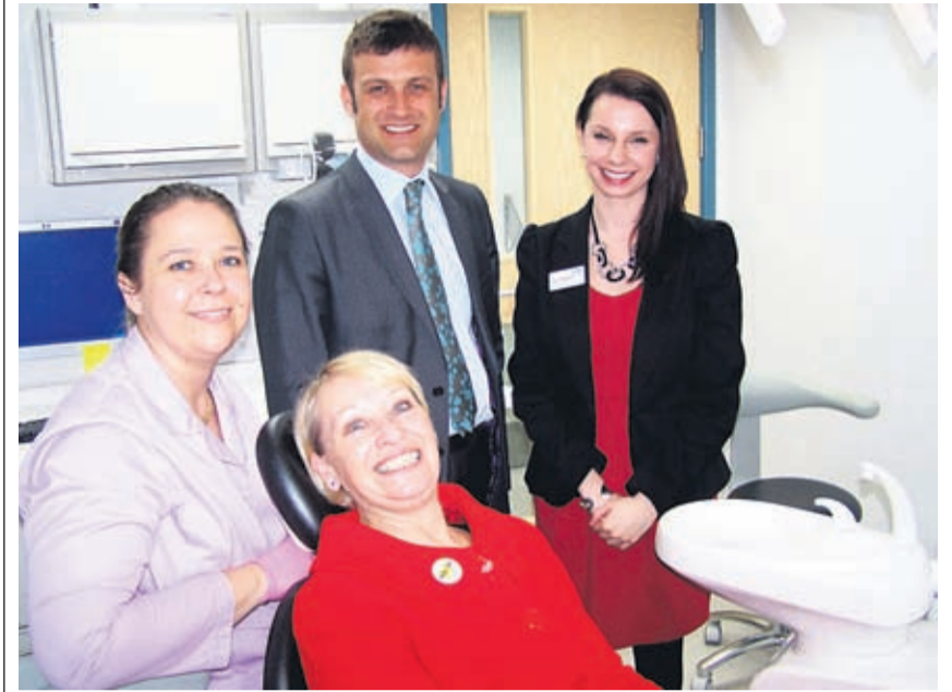
Sheryll Murray MP was delighted to open the new NHS dentist in Fore Street in Saltash. The dentist is already treating 60 patients a day and 1300 local people are registered.