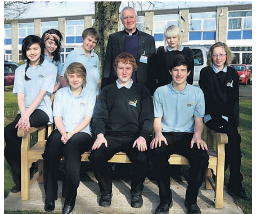
Pictured with the Bishop of Plymouth are students from Years 9 and 10 at saltash.net community school.