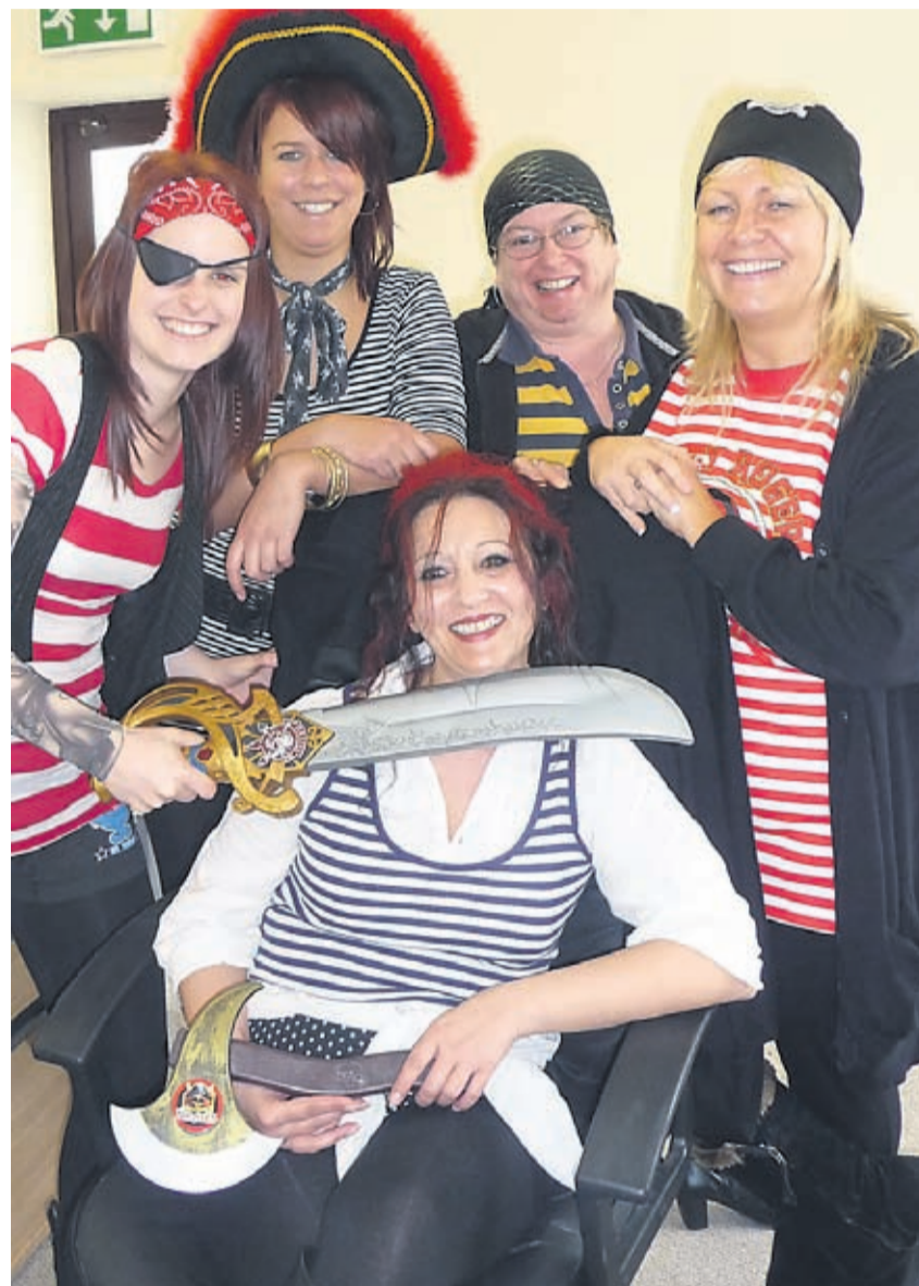
The girls, from the Hearing Room who described themselves as 'The Pirates of Mens' Pants' also adorned themselves with eye-patches, bandanas, nautical looking beards, hooks and even a large and colourful parrot. More photos and story on Page 12