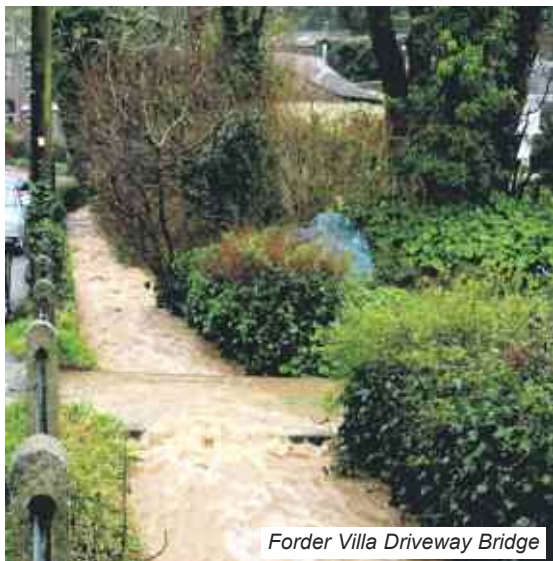
Forder Villa Driveway Bridge