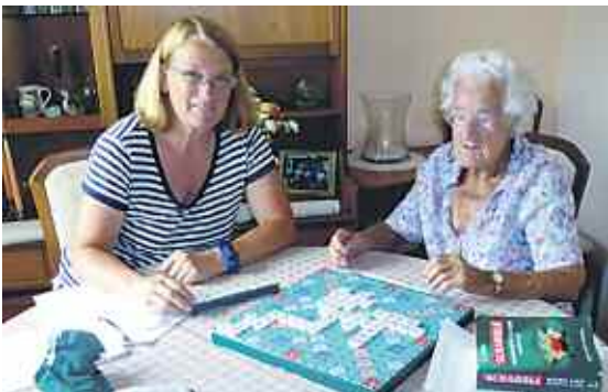
renowned for playing a mean game of scrabble!