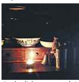
As the lights go out...thei memories burn bright

There was a small exhibition of World War 1 memorabilia in the church. Full exhibitions on the theme of World War 1 and the Saltash Home Front before and during 1914 - 1918 are open throughout the Summer and Autumn in the Saltash Heritage Museum and Elliots Shop