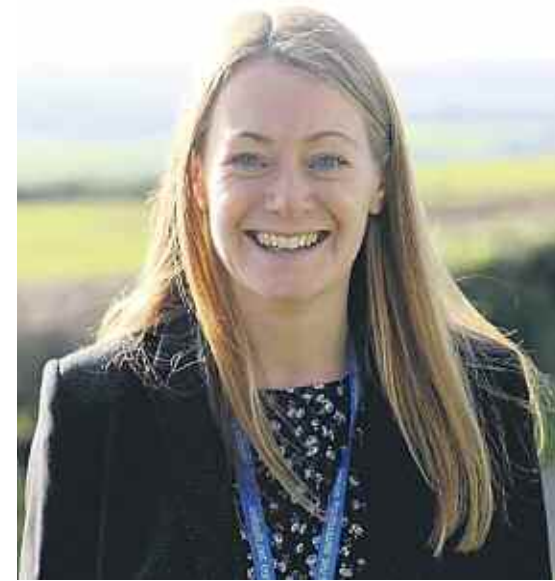
Being a Headteacher is like being an athlete: sometimes you have to sprint; sometimes you have to pace, but you couldn't do it if you didn't have a team around you going the extra mile.