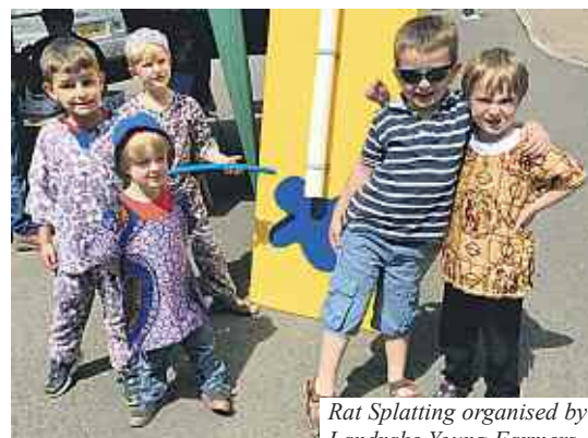
Rat Splatting organised by Landrake Young Farmers attracts an eager audience of boys from Sir Robert Geffery School.

Cornwall Council had already agreed to pay for half the cost of the course plus the card. The Town Council's services committee agreed to pay the other half and will encourage anyone interested to sign up for courses to be held in the Guildhall. It is hoped to encourage more community engagement from residents who might not yet be involved with community projects.