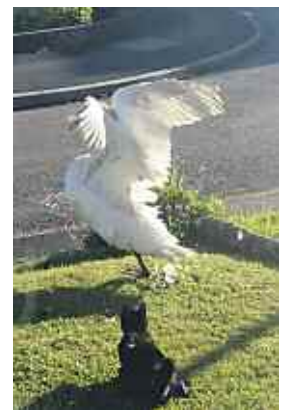
A motion picture - Cat and Swan in chase!