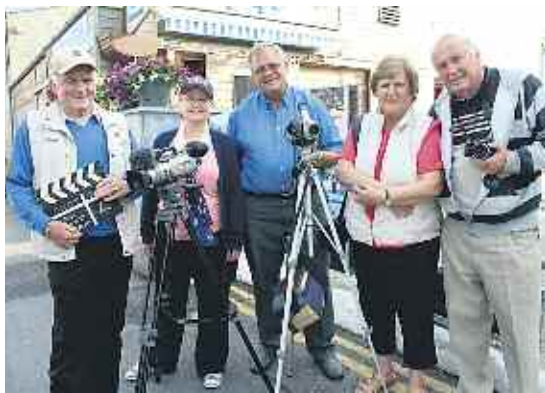
Saltash Video group are pictured here at the end of the line.