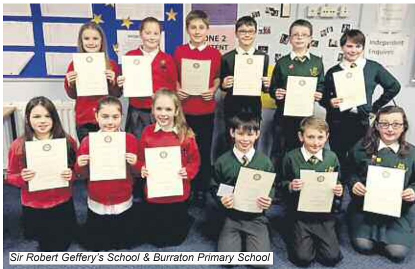
Sir Robert Geffery's School & Burraton Primary School