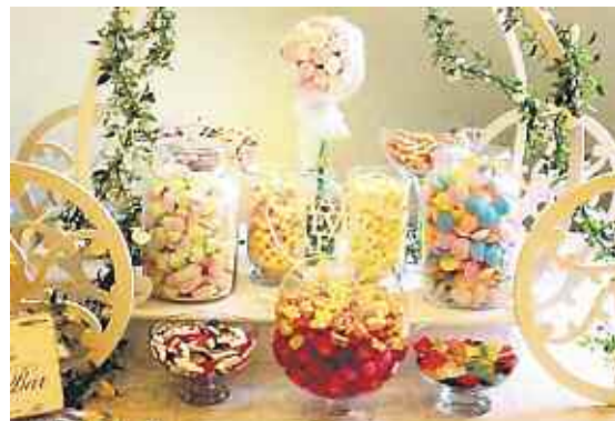
Truly Scrumptious Wedding Cart