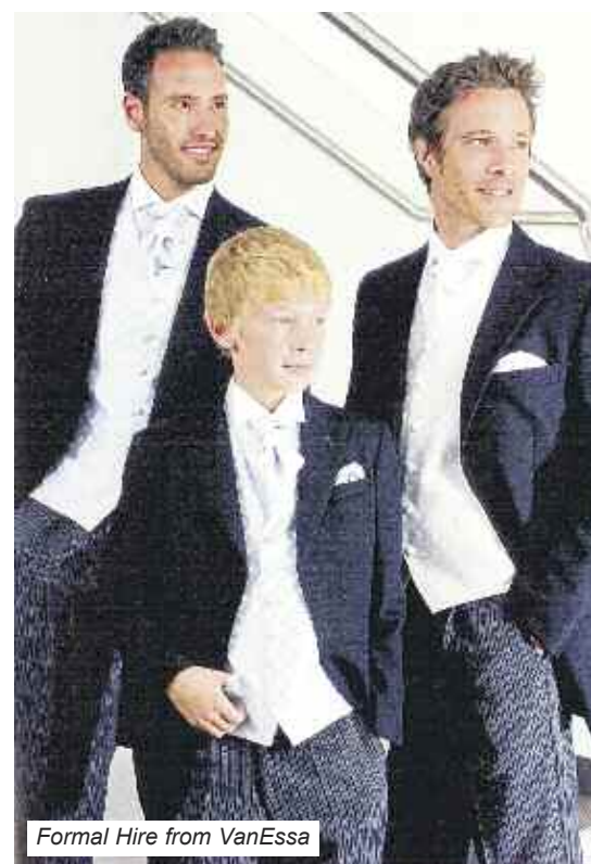
Formal Hire from VanEssa