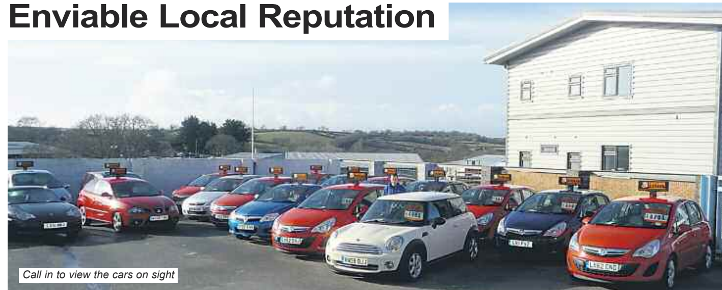
Call in to view the cars on sight