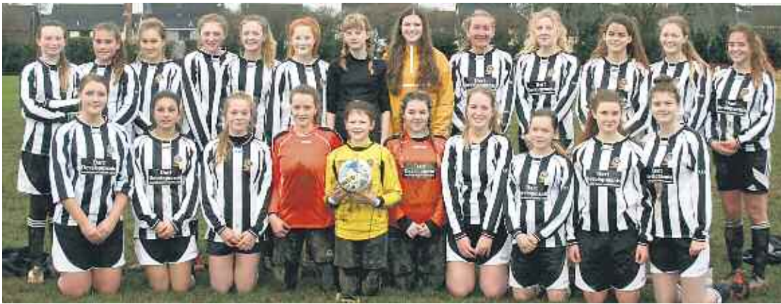
Pictured above U14s and U16s girls teams who took part in a recent charity match in aid of Little Harbour Children's Hospice.