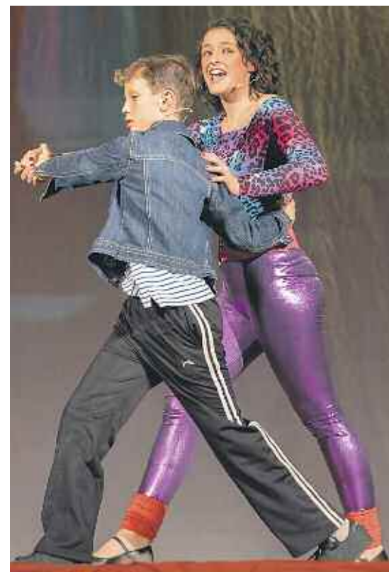
See article page 5 and review on page 8