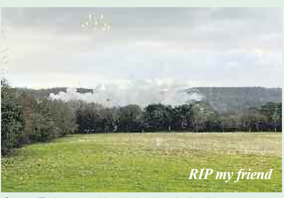
Steam Train passed by during the dedication

Given the foregoing, what can we do? Is there an answer? There must be, but it should bring together worldwide all people of honest goodwill. Humanity does not have much time.