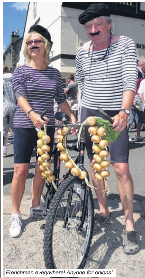
Frenchmen everywhere! Anyone for onions!

The hospital not only offers Saltash a minor injuries unit and a theatre for minor operations but a wide service of day clinics of which there are twelve at present and fast increasing in scope.