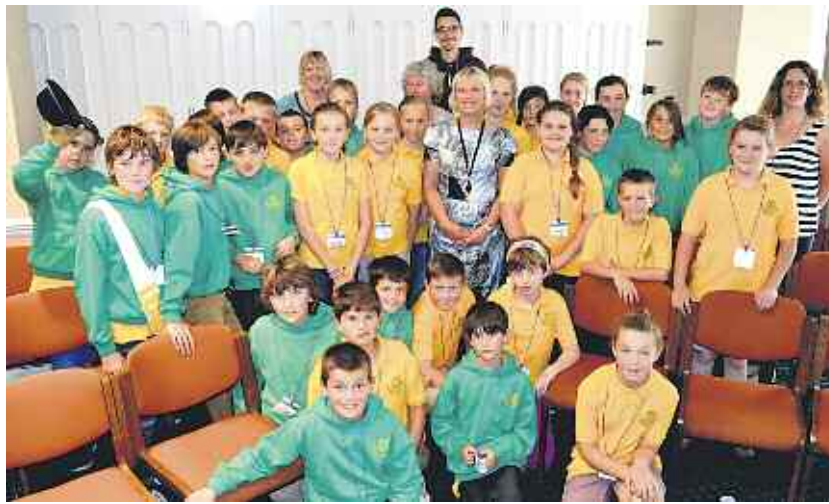
Pictured: Sheryll with the class from Sir Geffery's Primary School

Today local MP Sheryll Murray was pleased to meet with children from Sir Geffery's Primary School in Landrake who visited Parliament as part of an Educational trip to London.