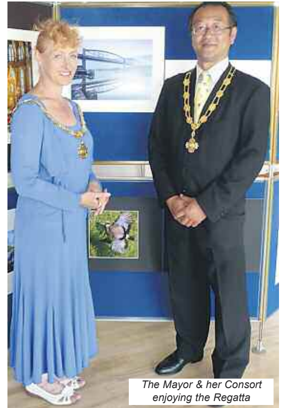
The Mayor & her Consort enjoying the Regatta

The sun shone, the racing gigs flashed along the river and the crowds poured down to Saltash Waterside to share the fun of the traditional Saltash Regatta and Waterside Festival.