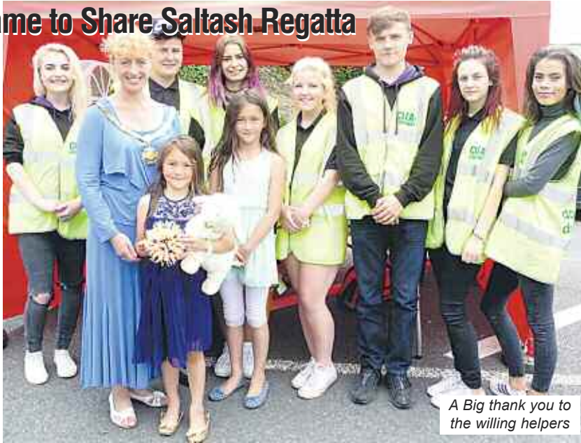
A Big thank you to the willing helpers

There had been some doubt as to the gig racing taking place since the Jubilee Pontoon, opened in 2002 had been declared dangerous. Unless it is repaired by next year the future of the racing, which attracts participants from all over the South West and beyond, must be in doubt.