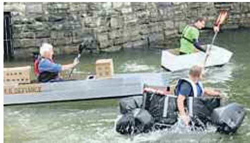
Cardboard Boat Race