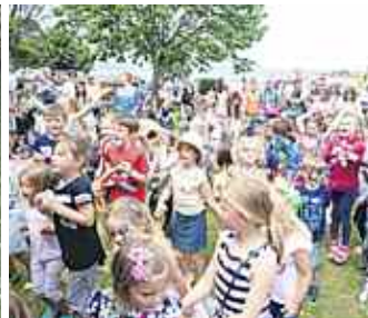
The children enjoyed the entertainment