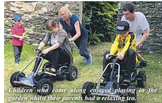
Children who came along enjoyed playing in the garden whilst their parents had a relaxing tea.

A party of seven members of Wesley church will be visiting Mbare in July.