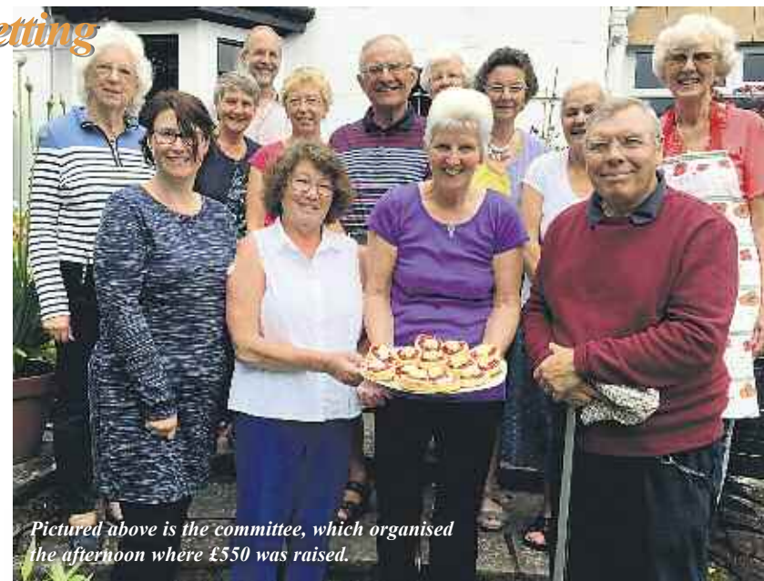
Pictured above is the committee, which organised the afternoon where £550 was raised.