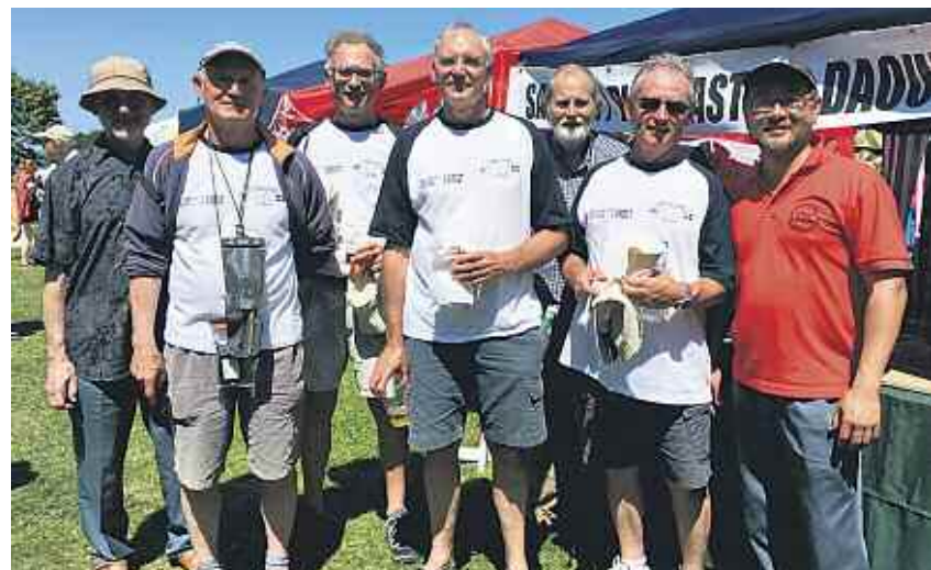
Pictured above: Breton Boatmen - Among the scores of pilot gig boat crews was one representing Saltash's twin town. Six crewmen and a cox were specially invited to cross from Plougastel, to compete in an international event.