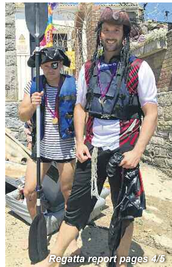
Regatta report pages 4/5

Once consultation closes on 7th August, Cornwall Council will review all representations received and decide whether the project should move on to the next stage which will be an 'examination in public,' independently undertaken by the planning inspectorate. They will decide whether the council can adopt the document. As and when adopted it will be of significance in the consideration of future planning applications in Saltash and other towns covered, and all such application will be considered on the basis of whether or not they comply with the Cornwall development plan.