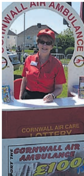
Support the Air Ambulance lottery