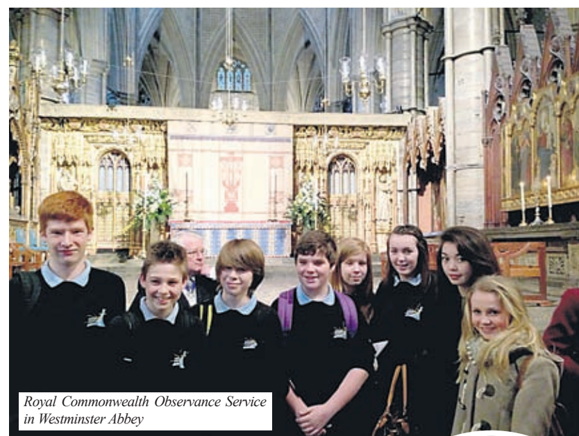
Royal Commonwealth Observance Service in Westminster Abbey

The 'Saltash Hopper' bus bore students to the dreaming spires of Oxford where they were immersed in the city and colleges – and the location scene for Hogwarts dining hall. Others travelled to London as some of the fortunate thousand