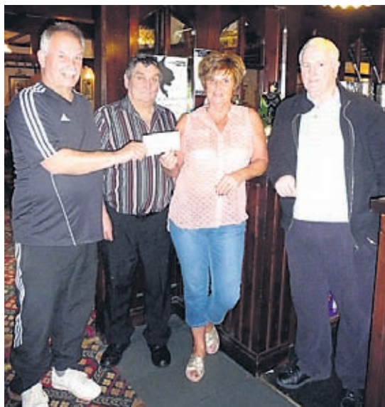
The Ploughboy Euchre team enjoyed another of their fund raising days out, visiting other pubs and playing Euchre whilst enjoying a few fun games along the way to raise money for local charities, it was the turn of The Breakthrough Breast Cancer charity to benefit by the sum of £330.00 on this occasion.