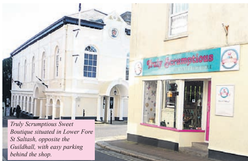
Truly Scrumptious Sweet Boutique situated in Lower Fore St Saltash, opposite the Guildhall, with easy parking behind the shop.

As well as Easter Eggs 'Truly Scrumptious' offers an intriguing choice of Easter gift boxes designed to bring lasting pleasure through the Easter holidays.