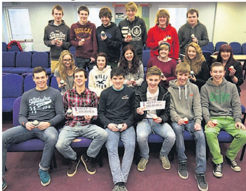
An enterprising group of 6th Form students at saltash.net community school took advantage of a captive audience of parents to help raise the excellent sum of £225 for the charity 'Help for Heroes'.