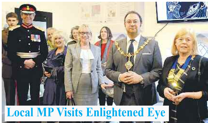
Local MP Visits Enlightened Eye

Lieutenant Colonel E T Bolitho OBE, took place throughout the museum with the new interactive segment in the mining exhibition.