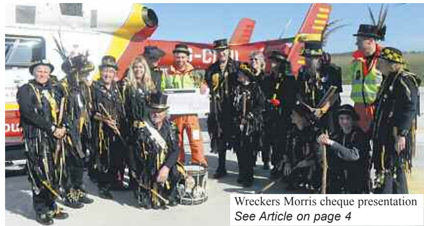
Wreckers Morris cheque presentation See Article on page 4

She has also been highly involved in organising major events from the Olympic Torch run to the annual Christmas festival and still finds time to work as a self employed translator of Japanese.