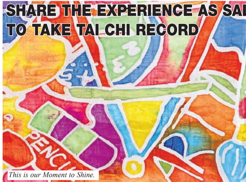
This is our Moment to Shine.

Olympic records are expected to be broken in Britain this summer, and Saltash is set to achieve its own record-breaking experience with public support from young and old.