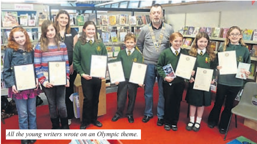
All the young writers wrote on an Olympic theme.