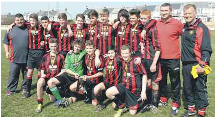
Saltash United Under 15's Cornwall Champions. A match held at Kimberly Stadium against their local rivals Saltash Youth !!! The match went to penalties with United victorious. It was the Cornwall Cup, very rare both teams being from Saltash.