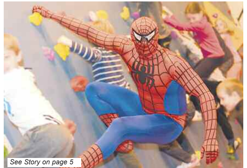
See Story on page 5