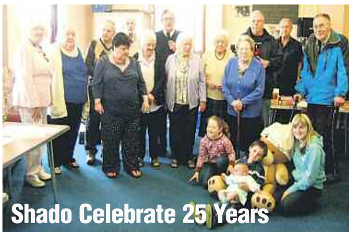
Shado Celebrate 25 Years