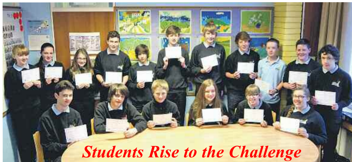
Students Rise to the Challenge

Observer Telephone Numbers 07971484872 or 01579 345699 Email your copy to: marye.crawford@virgin.net