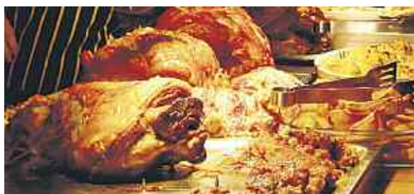
OAP: Carvery Monday – Friday 12noon - 3pm £4.50