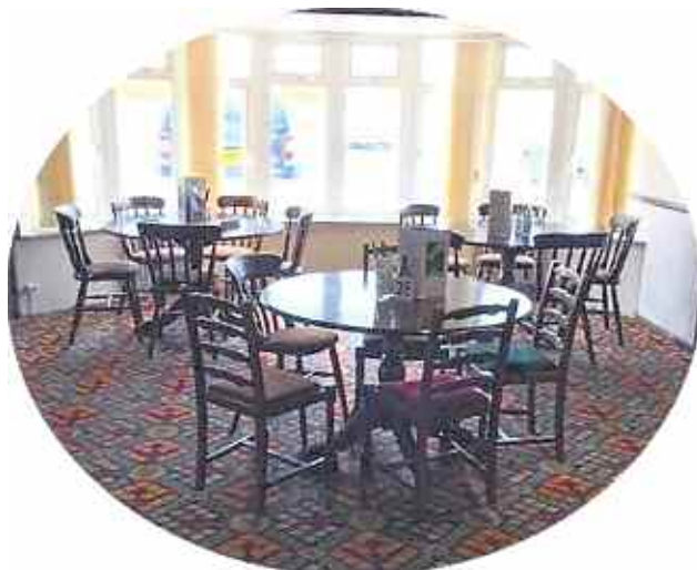
Tuesday from 5pm - 2 Steaks for £12.00 Friday from 5pm – 2 Fish & Chips £12.00