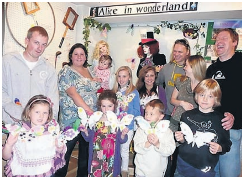
Fluttering butterflies abounded in the Local History Centre above Saltash museum as children joined in the Big Draw organised by Saltash Heritage.

This years theme for the nationwide Big Draw scheme included endangered species and Heritage decided to enhance the ‘Alice in Wonderland’ tableau of the ‘Pastimes of Past Times’ exhibition with a colourful display of butterflies. A happy group of children were soon cutting out and decorating some brightly-hued butterflies which they displayed on the dias in the museum.