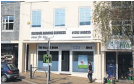
Visit our New Showroom in Fore Street, Saltash