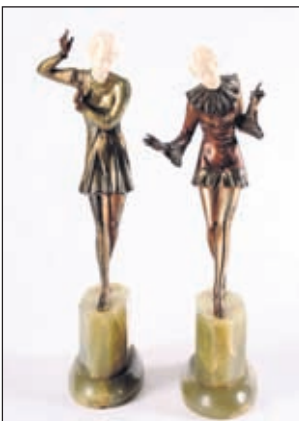
A pair of Art Deco bronze figures by Lorenz offered at £3,000-£4,000