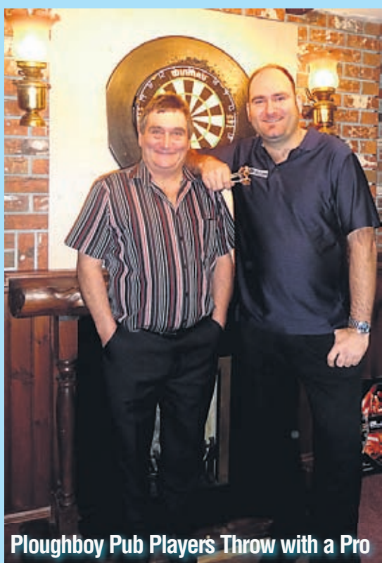
Ploughboy Pub Players Throw with a Pro

Meanwhile those who prefer to relax and enjoy sport on the big screen can do so in the Ploughboy lounge, where all major football and other matches are broadcast, while enjoying their favourite drink in friendly company.