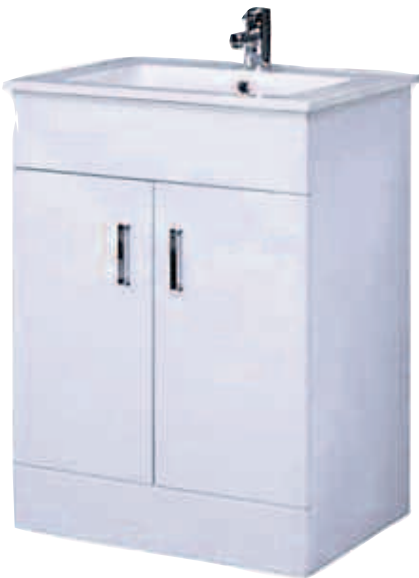
Vanity Unit from £149.99