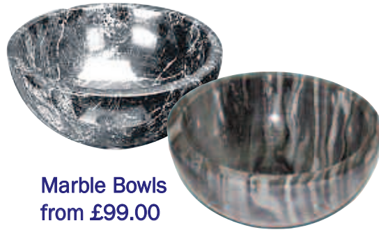
Marble Bowls from £99.00