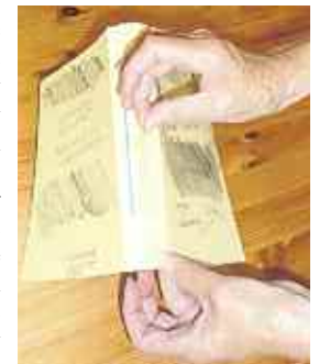
Book binding in the Bookshelf