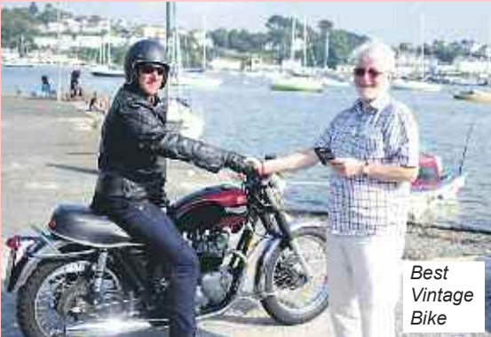
Best Vintage Bike