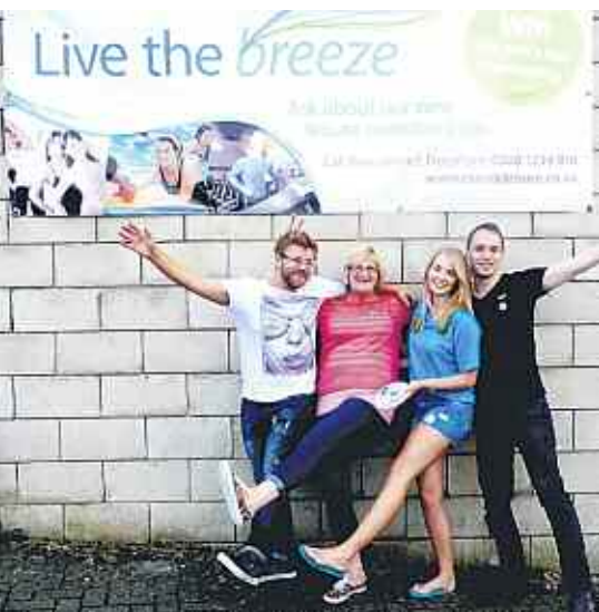
Staff at Saltash Leisure Centre baked cakes and put on their Jeans to raise money for Jeans for Genes Day.

Jeans for Genes Day is an annual fundraising event and took place on Friday 19th September 2014. Jeans for Genes raises money for Genetic Disorders UK and aims to change the world for children with genetic disorders.