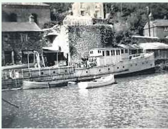
'Atalanta' moored at Forder Creek between 1949-1957

Forder Creek, which is abutted by local inhabitants who help care for the village and its surrounding natural environment, under the auspices of the Forder Community and Conservation Association (FCCA), which is a registered charity, and of which I am the proud Patron. Moreover, a small group of Trustees, supported by other villagers, supporters, volunteers and the wider populace, guard the village of Forder and the surrounding areas jealously, and oversees the village preservation, protection and conservation. Indeed, if the little Forder waterways could reveal some of its intriguing past history,