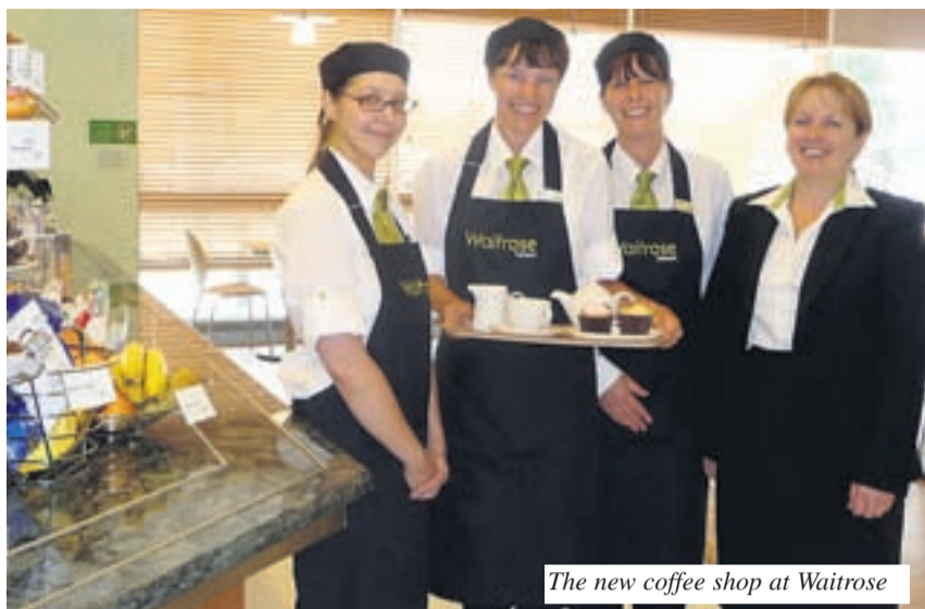
The new coffee shop at Waitrose

The Waitrose management are already delighted with