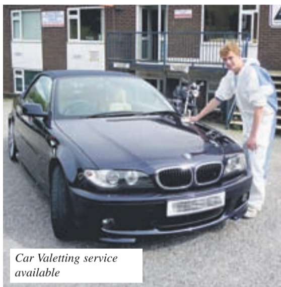
Car Valetting service available

While ensuring that each and every vehicle is returned in perfect order South West Accident Repair Centre have always included a full cleaning and valetting service.