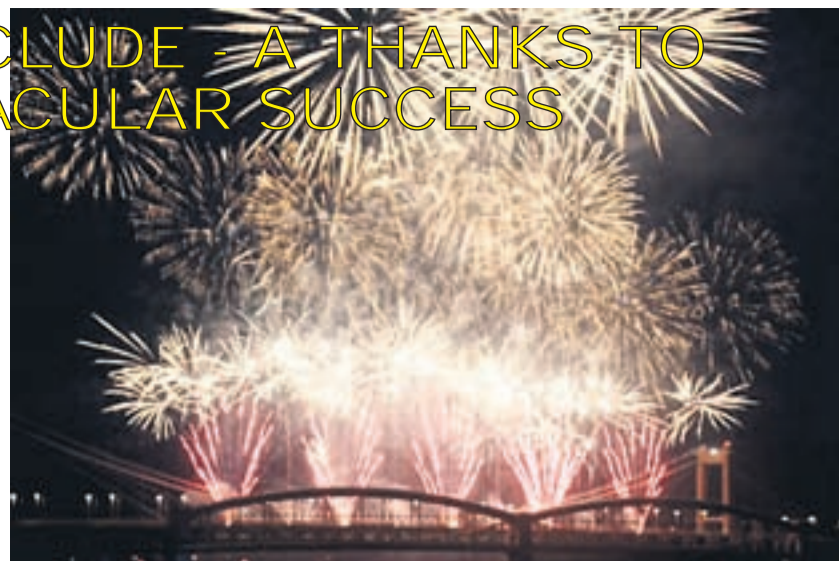
Fabulous Fireworks! like they have never seen before in Saltash

Draw tickets, are available at the Ashtorre Centre during all opening times and during the opening of the art exhibition up until Monday 31st August when the grand draw takes place.