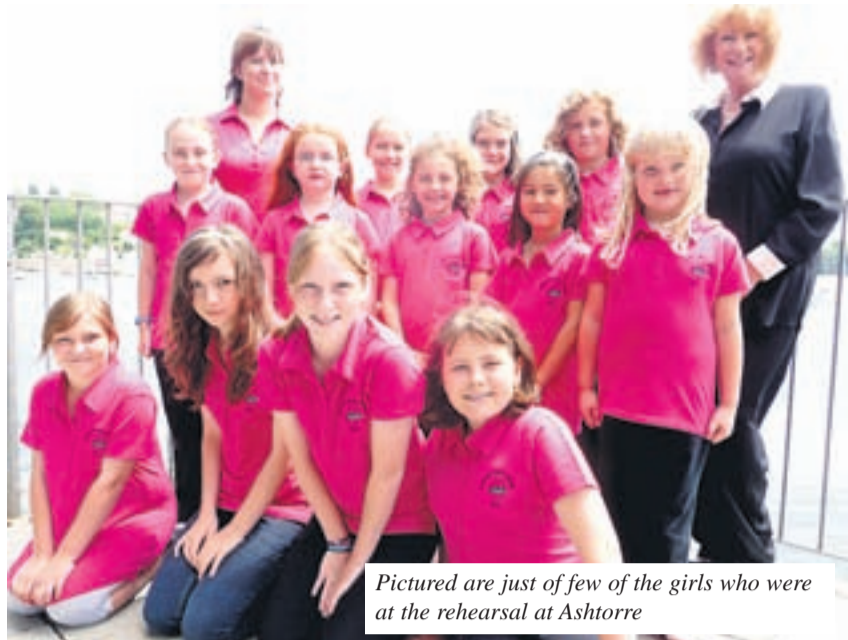
Pictured are just a few of the girls who were at the rehearsal at Ashtorre