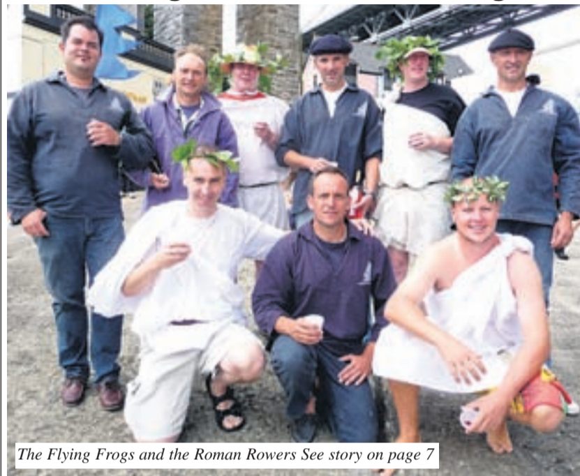
The Flying Frogs and the Roman Rowers See story on page 7

line, and also give details as to our leaflet distribution services. All of this can of course, be followed up by a telephone call or e-mail to discuss individual needs.