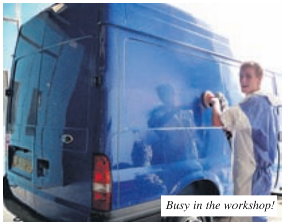
Busy in the workshop!