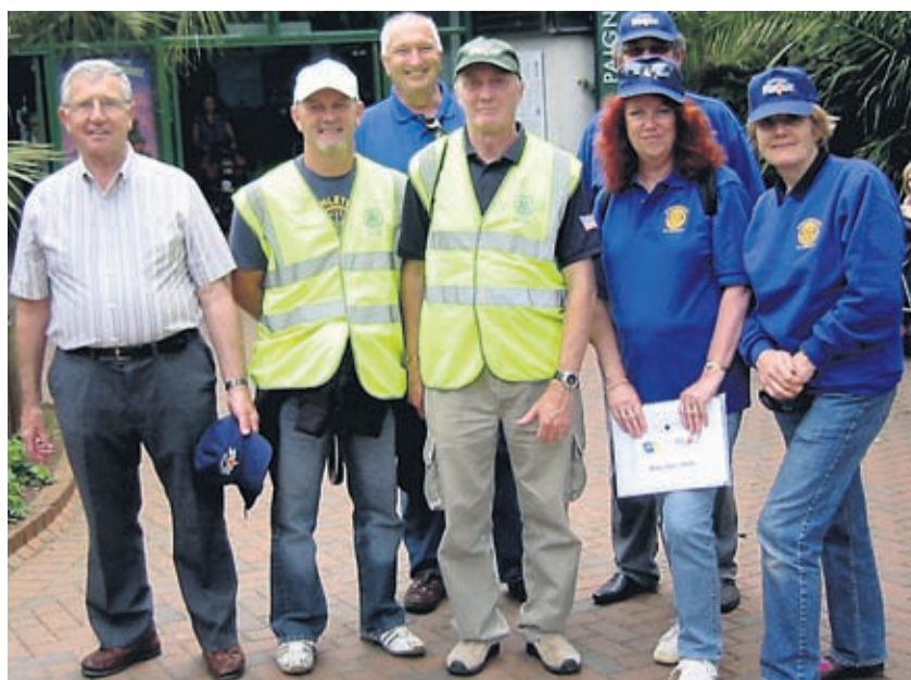
Pictured above Members of Saltash & Plymouth Rotary clubs 'kids out team' who recently travelled to paington zoo with 160 kids drawn from schools in Plymouth & Saltash. The weather was kind and all had a fun day out, thanks to the staff at the zoo and Appleby Westward saltash who provided the kids with a treat.