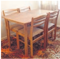
Table & 4 Dining Chairs

Good solid set £30 Bargain Buyer collects Plymouth area