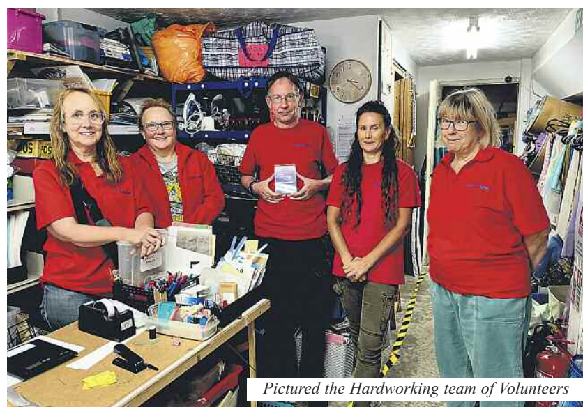
Pictured the Hardworking team of Volunteers

Back in Saltash the Scrapstore is now re-introducing the wooden collecting boxes, beautifully hand crafted in The Shed, for contributions towards Saltash's fabulous Christmas festival. They will be distributed around businesses in the town so when shopping in the Scrapstore or elsewhere all are asked to look out for the boxes and perhaps put in some loose change to help ensure the future of our very own special Christmas event. Scrapstore also each year, funds the Lantern Parade, a favourite feature of this festival especially among the many children who take part.