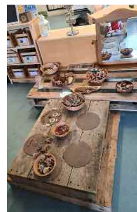
Wooden bowls & wonder - where reuse meets early learning.

The group's motto is simple: Share it, don't hoard it and please don't take it to the tip - there are so many items we can reuse and extend the life of everyday items. With every post, Saltash residents are proving that sustainability starts wonder - where reuse meets early learning.